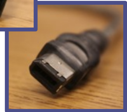
Firewire 400 (6-pin)