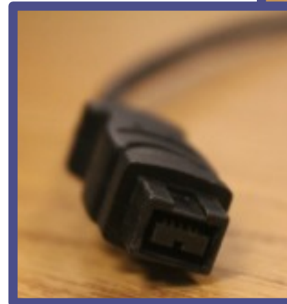
Firewire 800 (9-pin)